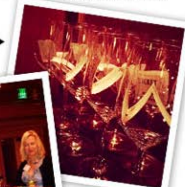
A beautiful evening ▶