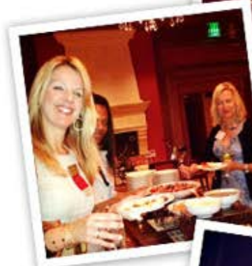
◀ Enjoying the fabulous spread