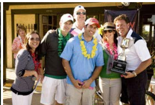
Golfers having fun out on the course.