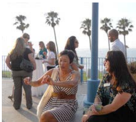
Event attendees chat and enjoy the beautiful La Jolla view